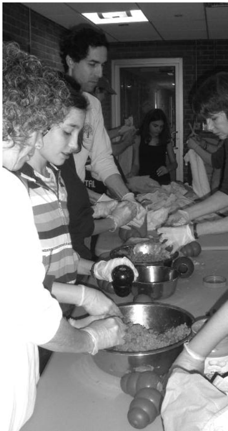
Making Doggie Treats —Mitzvah Day volunteers create special treats for shelter animals.