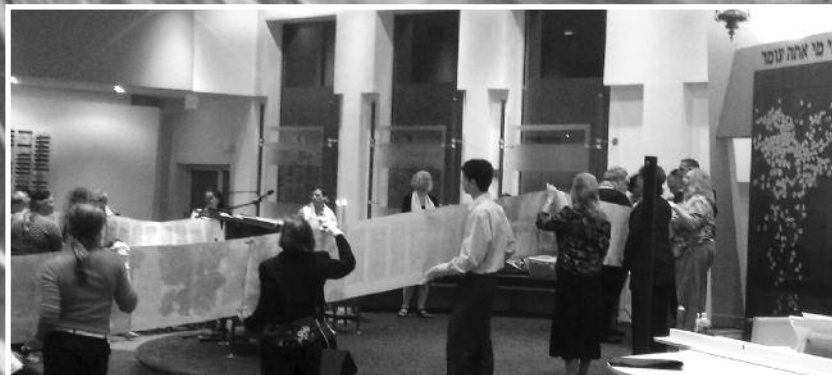
One of the rarer occurrences at Temple Shalom—unrolling the entire Torah scroll at Simchat Torah to rewind from the end of Deuteronomy back to the first chapter of Genesis. Congregants donned clean, white gloves and handled the delicate parchment carefully as it spanned the sanctuary.