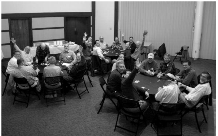
Brotherhood Poker Night