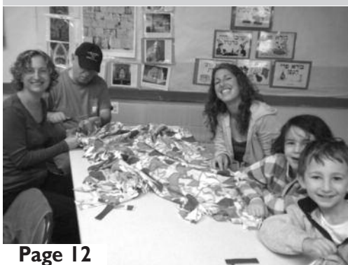
Mitzvah Day Beaming with joy, a Project Linus team works on a snugly blanket for a hospitalized child.