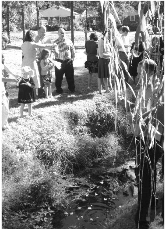
Temple Shalom congregants toss bread into a flowing body of water to symbolically cast off their previous year's sins.