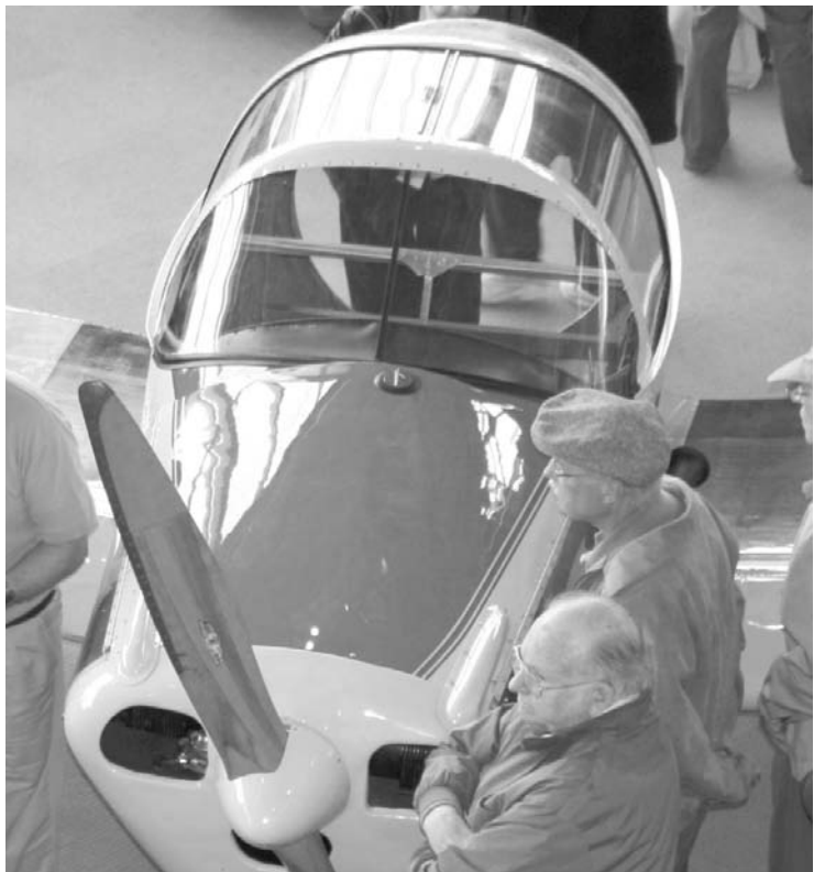
The Renaissance Group tours the College Park Aviation Museum on April 29, 2008.